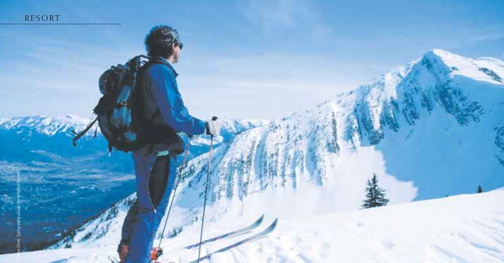
Spring skiing above Fernie Alpine Resort